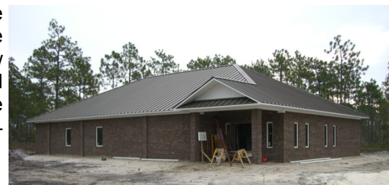
Exterior of New Hope Clinic under construction in Boiling Spring Lakes - March 1, 2010.

After ten years of working out of the cramped quarters of Unit 202 in the Sentry Storage Business Park, New Hope Clinic's volunteers, staff and patients are anxiously awaiting the move to the Clinic's new home in Boiling Spring Lakes.