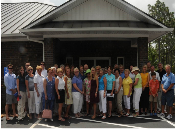
(Volunteers at New Hope Clinic)